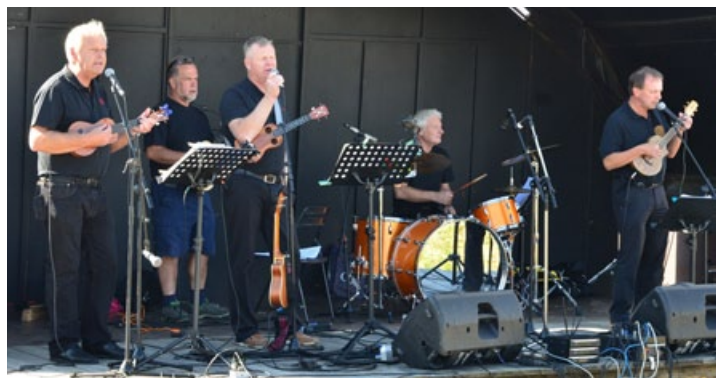
The Ukulele Orchestra of Sweden played popular pop and rock songs from the 60's 70's, but on the ukulele.