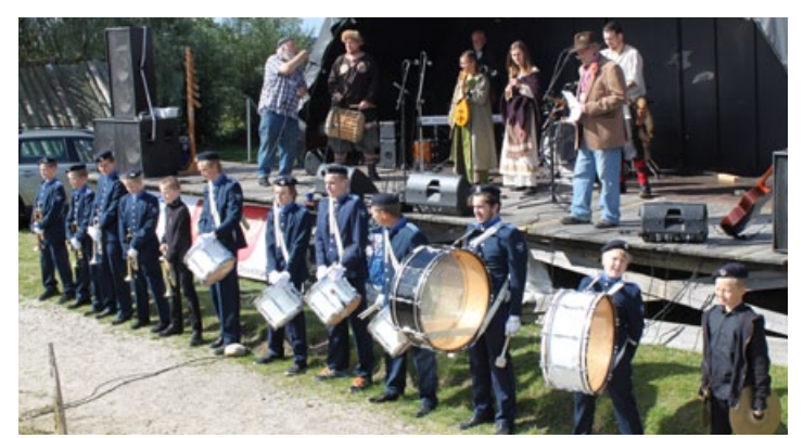
Vellinge Music Corps opened the festival when they came marching from Höllvikens library followed by .....