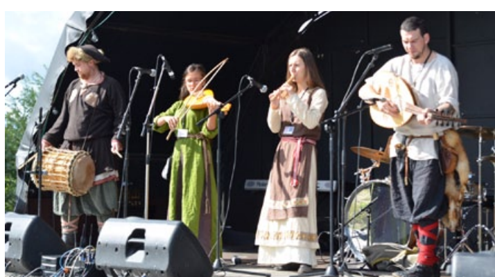
Grupa Radnyna playing medieval music from Eastern Europe.