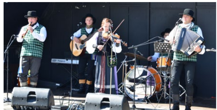
Grupé Karčema, in addition to their own songs, the band played well-known Lithuanian popular songs and classics.