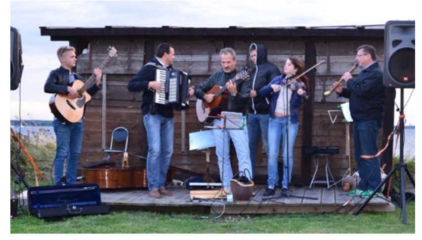
Grupé Karčema from Lithuania were inspired and played some of their own songs.