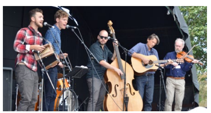
Alligator Gumbo played traditional and self-written Cajun music in a way that is true to tradition. The vocals was sung in Louisiana French.