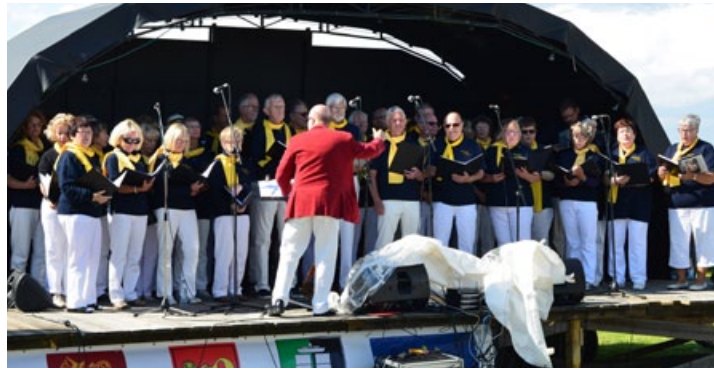
Taube Choir in Scania was singing songs of our Swedens most beloved national poet, Evert Taube, the poet who invented the Swedish summer.