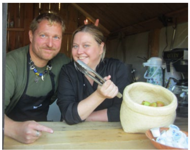
For those who did not had their own picnic food could buy food from Ragnar and Kinn.